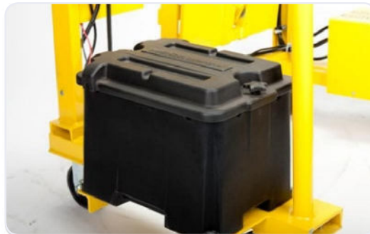
Batteries and battery box